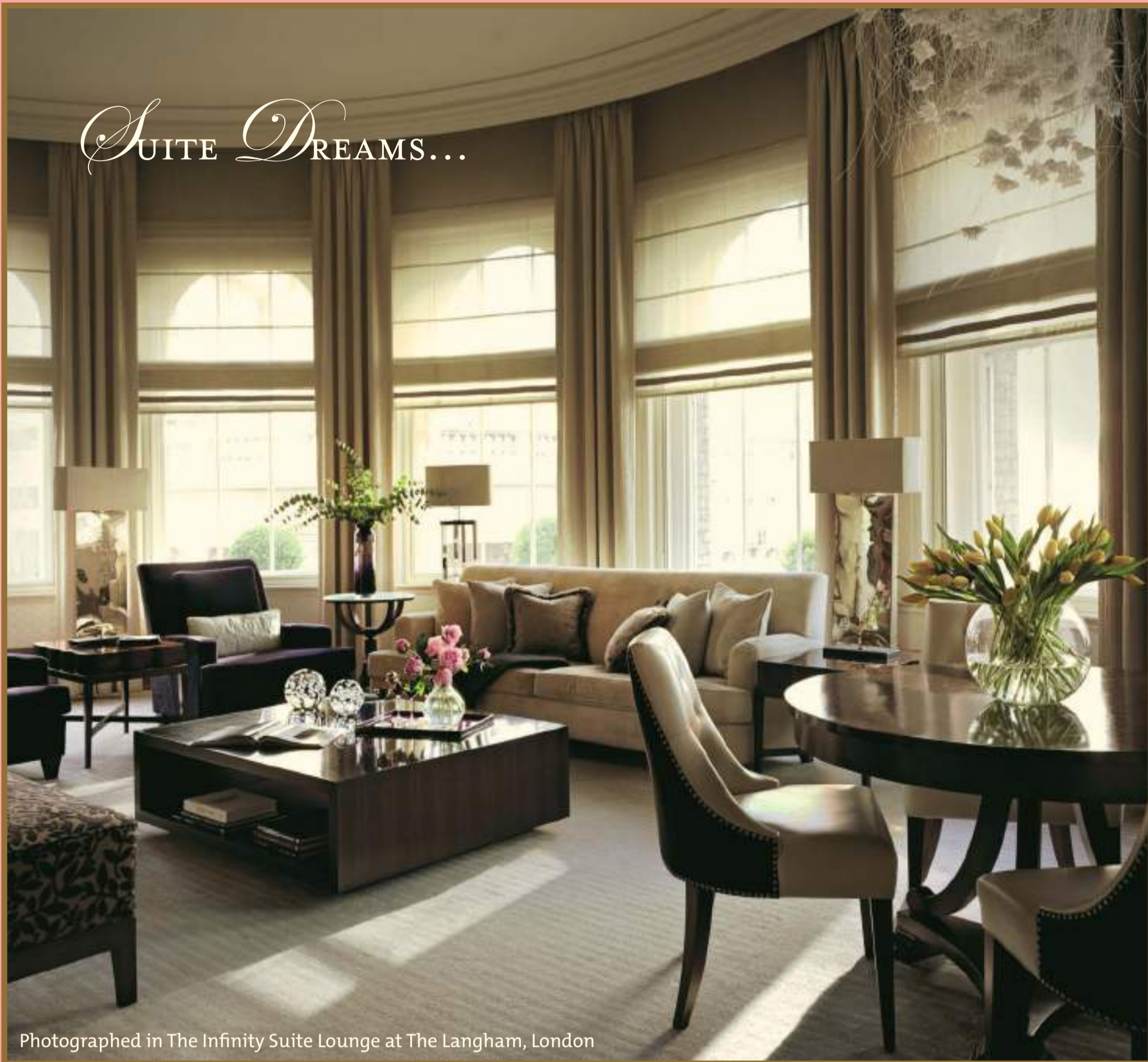
Photographed in The Infinity Suite Lounge at The Langham, London