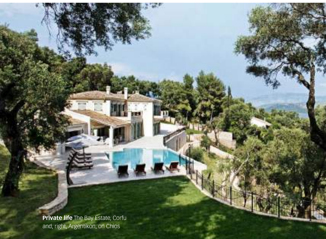
Private life The Bay Estate, Corfu and, right, Argentikon, on Chios

You may not want to venture out, but do, if only to take a private boat trip out into the deep