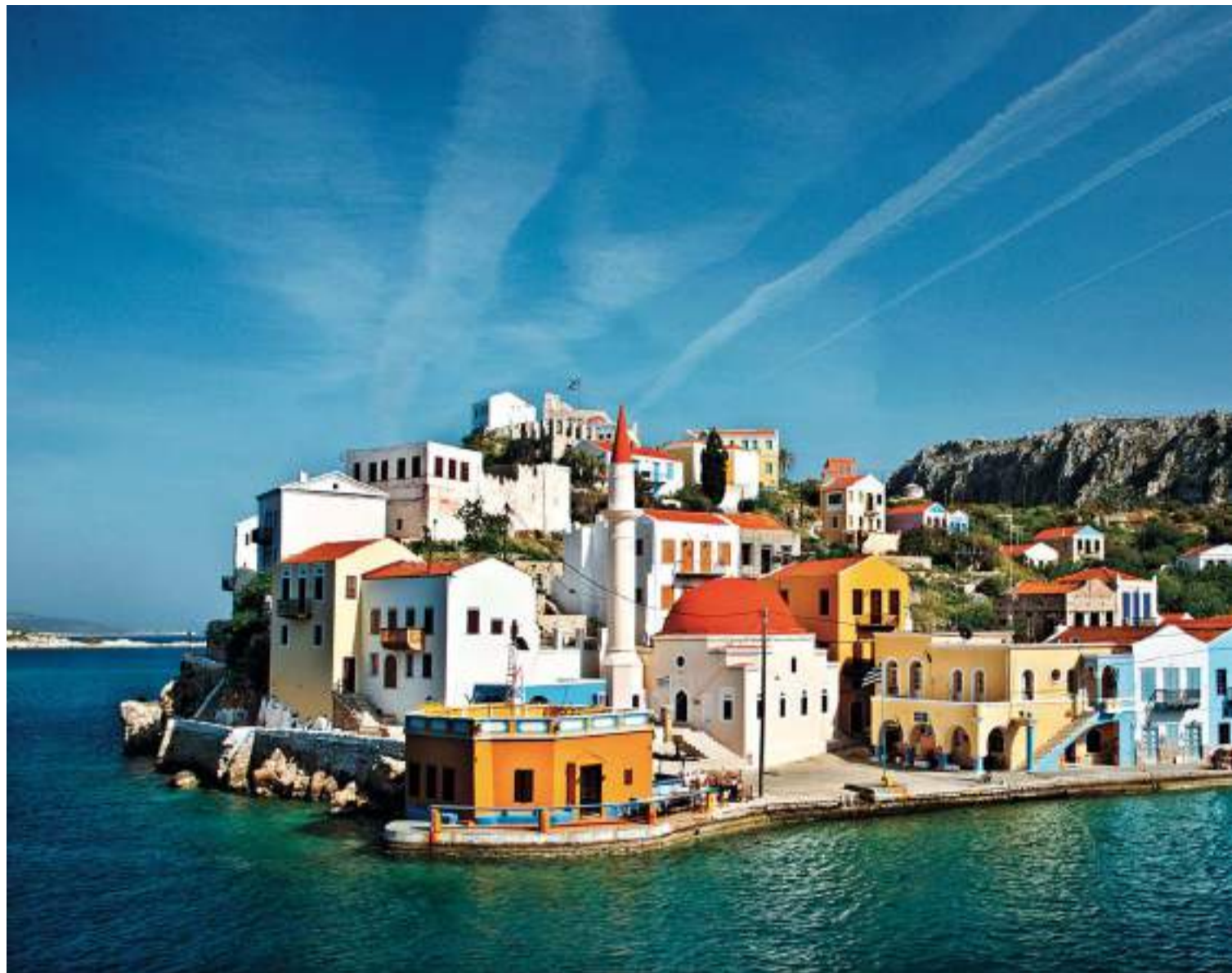
Greek unorthodox Colourful Kastellorizo, a few miles from the Turkish mainland, has a French-run boutique hotel. Below: painted stonework on Chios

The next best thing is Villa Faros (001 647 477 5581, privateislandsonline.com ; from around £23,300 per week, sleeps 16), on a private peninsula near Sigrí, on the big, calm island of Lesbos. This is more than just a villa. It offers the kind of yoga and spa treatments found in five-star hotels. There are three private beaches, a seawater infinity pool, a heated indoor wave pool and gardens that provide